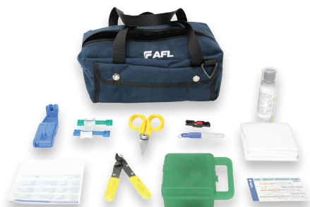
Tool Kit Contents