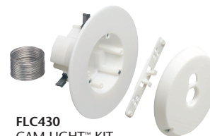
FLC430 CAM-LIGHT™ KIT

Includes CAM-LIGHT™ Box, 12 ft. support wire, 5" round plastic mounting plate, NM94 and NM95 non-metallic cable connectors, camera mounting bracket and mounting screws.