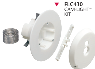
▼ FLC430 CAM-LIGHT™ KIT